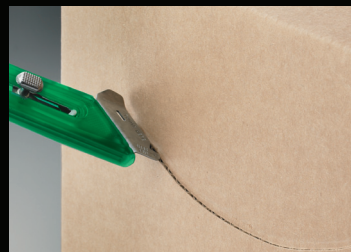
Tray Cut / Window Cut